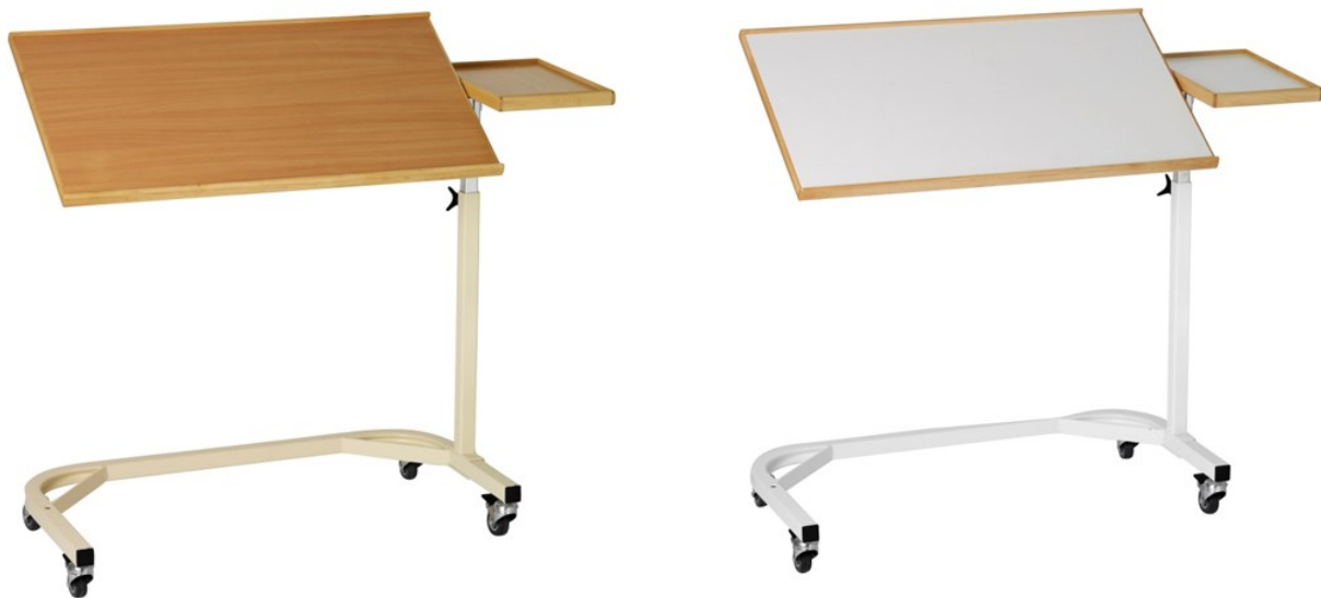
1-2503 Overbed table NORDIC LARGE beech