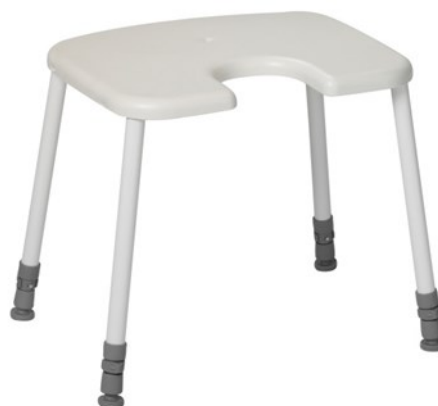
1-1111 Hygien seat