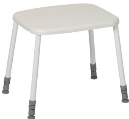
1-1110 Standard seat