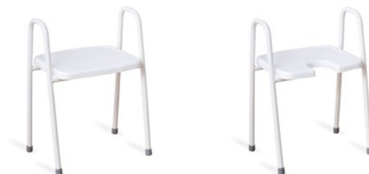
49-104 Standard-seat H = 50 cm

Steel construction, white powder coated. Seat height 50 cm - total height 70 cm 46 cm between armrests - total width 51 cm Large plastic seat with drain hole Anti-slide rubber feet for high security Max load 150 kg Weight 4,9 kg