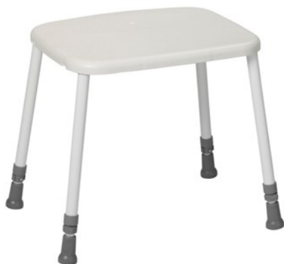
1-1110-T Standard seat