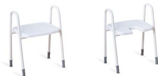
49-106 Standard-seat H = 45 – 60 cm