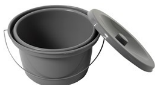
1-1290-99 Bucket with lid