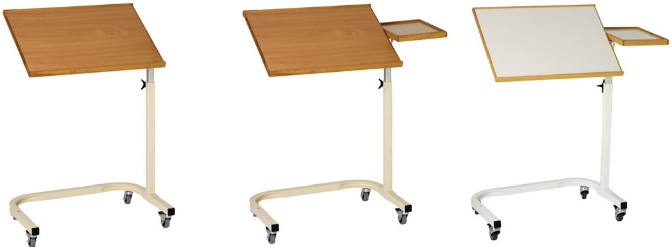
1-2501-0 NORDIC beech Without sideboard